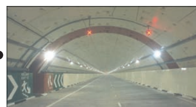
Technical Visit to SMART Tunnel