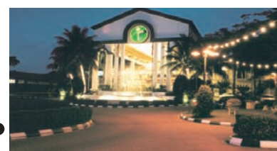
Golf at Tropicana Golf & Country Club

07:30 | Golf at Tropicana Golf & Country Club 09:00 | Technical Visit to SMART Tunnel